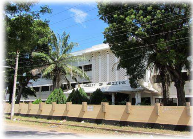
Figure 2. Entrance to the Faculty building