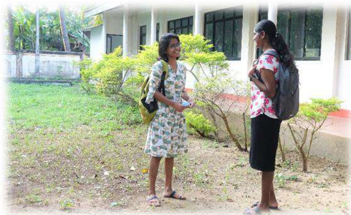
Figure 9. Pre-clinical students catching up outside the Student Centre

The pre-clinical course comprises an introductory period of 4 weeks and four terms of 10 weeks each.