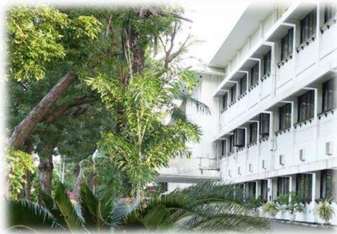
Figure 4. West wing of the Faculty

Telephone: 0212222073, 0212218173, 0212218170