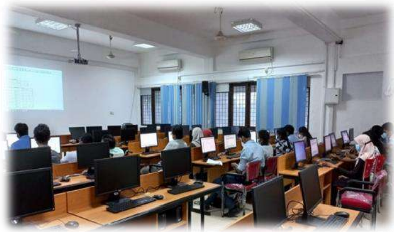
Figure 6. Computer Lab (2021)