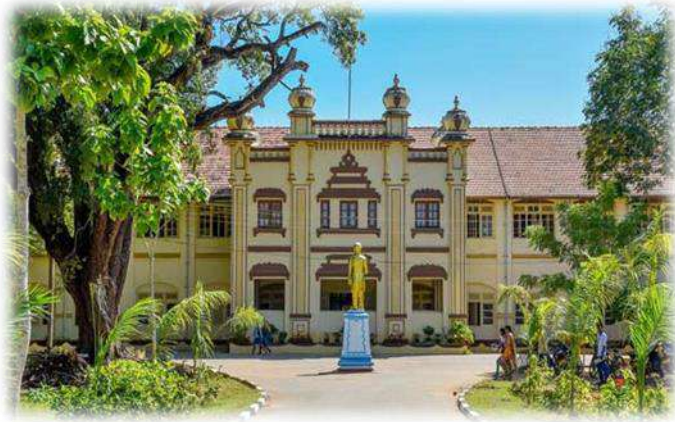
Figure 1. Administrative building on main campus

The University of Jaffna was established in 1974 as a small campus on a 30-acre piece of land belonging to Parameswara College founded by the philanthropist, Sir Ponnampalam Ramanathan. The University has grown since and is today home to ten faculties, with a student population of over 7000.