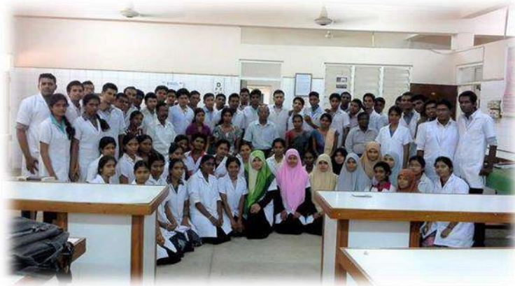
Figure 10. Pre-clinical students after a practical

The Evidence-Based Practice and Research Module (EBPRM), which begins in Phase 1 and continues into Phase 3, introduces students to basic research concepts in Phase 1 through lectures, practical activities, and small group discussions. Students must pass the EBPRM assessment in Phase 2 to proceed to the final year.