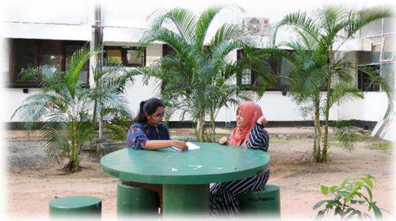
Figure 8. Stone benches at the rear of the Faculty

The Jaffna Medical Faculty follows an integrated traditional curriculum. The duration of the course is five years, and the medium of instruction is English. The curriculum is based on the Subject Benchmark Statement in Medicine of the Committee of Vice-Chancellors and Directors (2004) and the Standards for Undergraduate Medical Education of the Sri Lanka Medical Council.