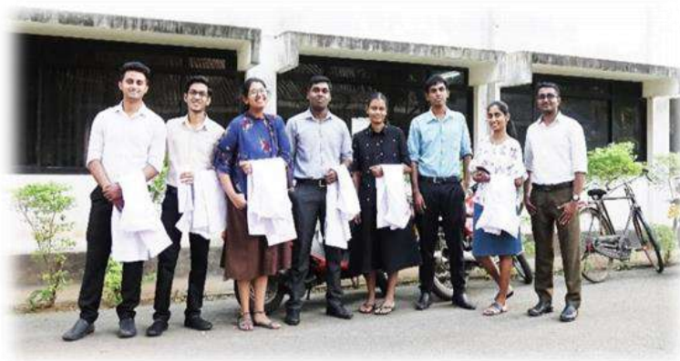
Figure 16. Outside the Student Centre

The MSU extends services through the Student Centre, which has a photocopy unit, IT centre, and gym. The photocopy unit opens from 9.30 am to 4.30 pm, and the Centre is open to students until 10.30 pm.