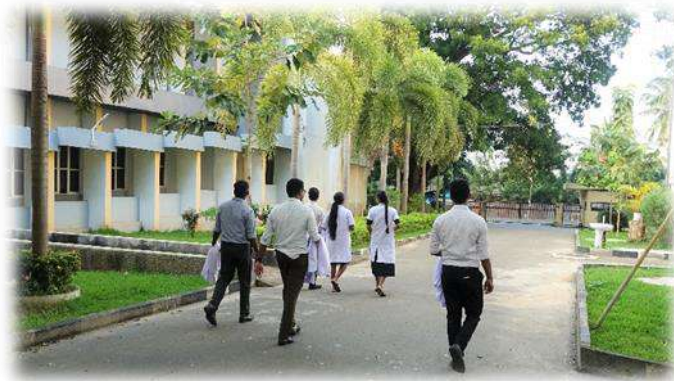
Figure 14. Students strolling by the Hoover Auditorium

The final examination consists of a common MCQ for students of all medical faculties set by examiners representing all the medical faculties and a clinical examination made up of similar components and standards ensured by participation of external examiners. A common merit list is compiled based on the results of the final examination.