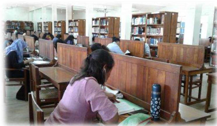
Figure 5. The Medical Library

The book collection of the library exceeds 16,000 and the library subscribes to a number of online periodicals. It has a collection of the latest textbooks with multiple copies, and a small collection of videos, CD-ROMs and slides.