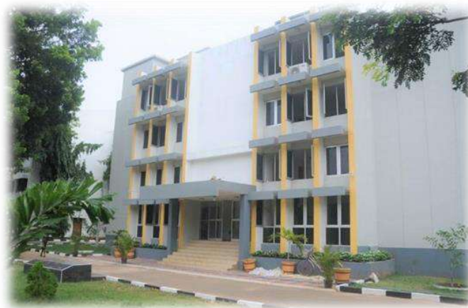
Figure 3. The Hoover Auditorium (est. 2014)

The Faculty went through a period of immense hardship with the worsening of the armed conflict, and had to temporarily relocate towards the end of 1995 and resumed functioning at Thirunelvely in mid-1996. Despite these setbacks, the Faculty continued to train students with the support of the extended faculty of specialists at the Teaching Hospital. The faculty has produced around 3000 doctors, with many serving with distinction.