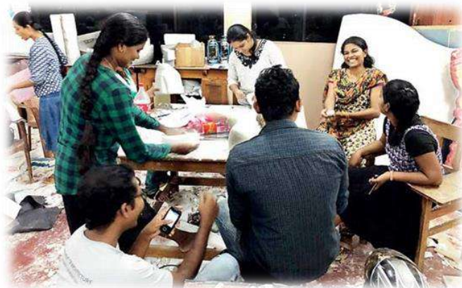
Figure 12. Paraclinical students preparing for Yarl Med Ex 2018

The course is conducted in the afternoons on weekdays. Microbiology, Parasitology, Community & Family Medicine, Forensic Medicine, Pathology and Pharmacology starts in term 5 and continues to term 11. Lectures in Paediatrics, Psychiatry and Surgery and the second phase of PPDS and EBRPM are also conducted in the afternoons.