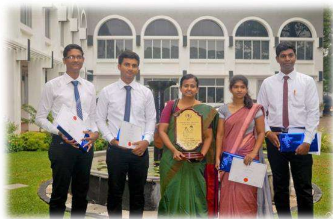
Figure 13. Final year students placed first at the Interfaculty Paediatrics Quiz (2016)

Before entering Phase III, an OSCE is conducted to ensure that the students have acquired the necessary clinical knowledge and skills to proceed to the final year. The marks from this OSCE are added to the continuous assessment (in-course) marks of the contributing subjects.