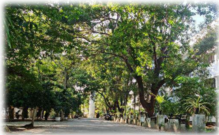
Figure 17. Rear of the Faculty