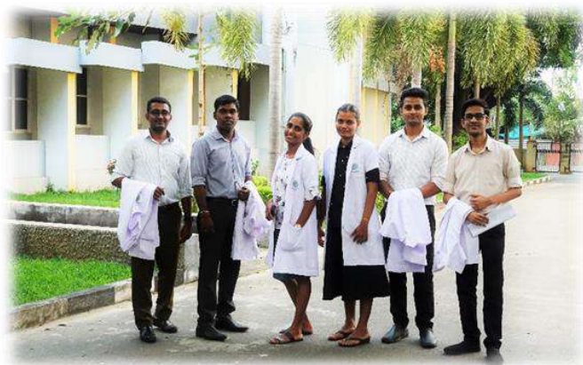
Figure 11. Paraclinical students by the Hoover Auditorium

Between terms 8 and 9, ten weeks are allocated for Community & Family Medicine field activities and EBPRM research activities. During Phase II students are trained in the hospital and community settings in the mornings and taught para-clinical subjects in the afternoons.