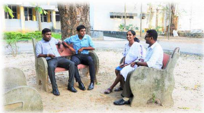
Figure 7. Stone benches by the Student Centre

As you begin life as an undergraduate, it is important that you reflect on the meaning of higher education and the responsibilities and obligations that come with your studentship.