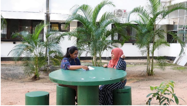
Figure 8: Stone benches at the rear of the Faculty.