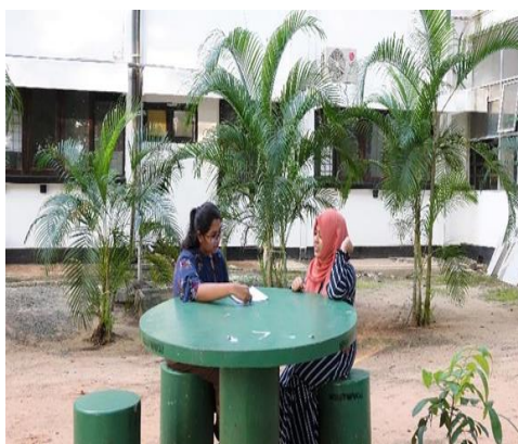
Figure 7 & 8 : Stone benches for students relaxation and combine studies.

Each member of the university community should fully understand the prestige of the institution and the self-esteem of its members. Therefore, all members should conduct themselves in a manner compatible with the university's quest and mission. Students must be polite in their words and actions, and should allow space for all people to live in harmony.