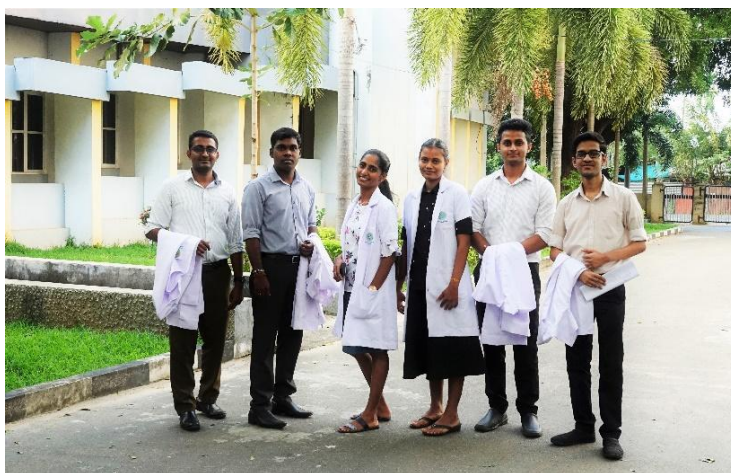
Figure 11: Para clinical students by the Hoover Auditorium.

During Phase II students are trained in the hospital and community settings in the mornings and taught para-clinical subjects in the afternoons.