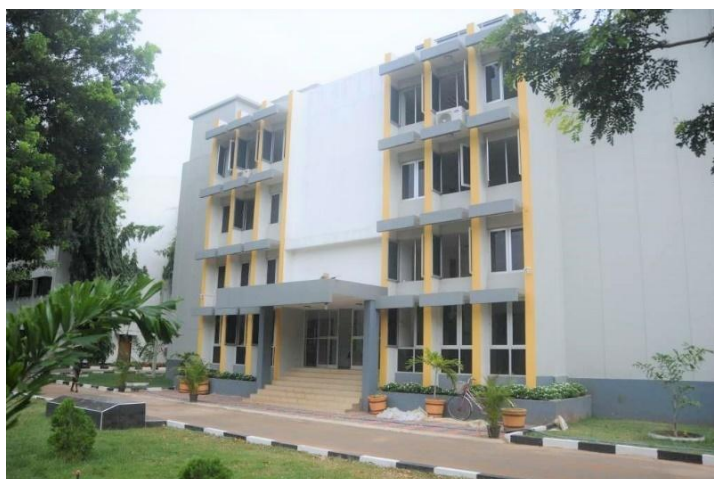
Figure 3: The Hoover Auditorium (Opened in 2014)

The Faculty went through a period of immense hardship with the worsening of the armed conflict, and had to temporarily relocate towards the end of 1995 and resumed functioning at Thirunelvely in mid-1996. Despite these setbacks, the Faculty continued to train students with the support of the extended faculty of specialists at the Teaching Hospital. The faculty has produced around 3000 doctors, with many serving with distinction.