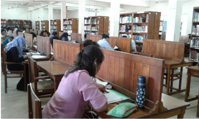
Figure 5: The Medical Library

The book collection of the library exceeds 16,000 and the library subscribes to a number of online periodicals. It has a collection of the latest textbooks with multiple copies, and a small collection of videos, CD-ROMs and slides.