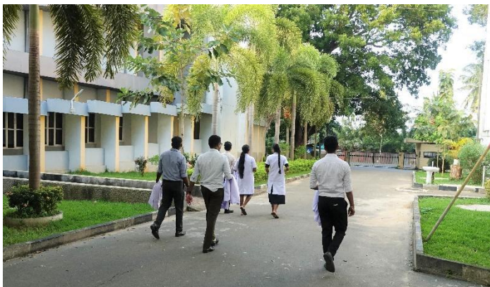
Figure 14 : Students strolling by the Hoover Auditorium.

on the results of the final examination.