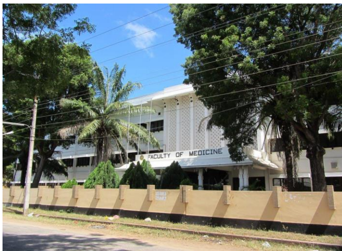
Figure 2: Entrance to the Faculty building