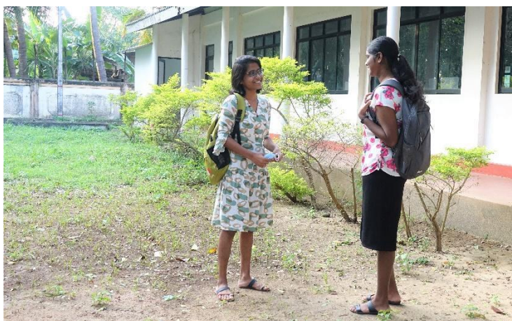
Figure 9: Pre-clinical students catching up outside the Student Centre.

The pre-clinical course comprises an introductory period of 4 weeks and four terms of 10 weeks each.