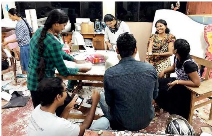
Figure 12: Para-clinical students preparing for Yarl Med Ex 2018

The course is conducted in the afternoons on weekdays. Microbiology, Parasitology, Community & Family Medicine, Forensic Medicine, Pathology and Pharmacology starts in term 5 and continues to term 11. Lectures in Paediatrics, Psychiatry and Surgery and the second phase of PPDS and EBRPM are also conducted in the afternoons.