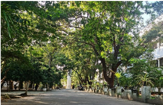
Figure 17: Rear of the Faculty.

The main function of the Alumni in relation to student welfare is coordinating financial assistance to students and supporting the general development of the Faculty. More information is available here .