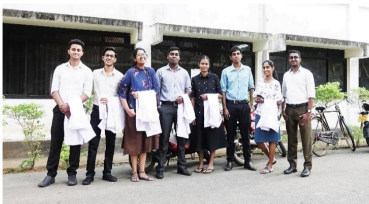
Figure 16: Outside the Student Centre

The Peer Support and Wellbeing Group (PSWG), which functions under the MSU, aims to identify and support students facing academic, financial and psychosocial problems and organize activities to develop life skills and enhance student wellbeing (see 4.3.7).