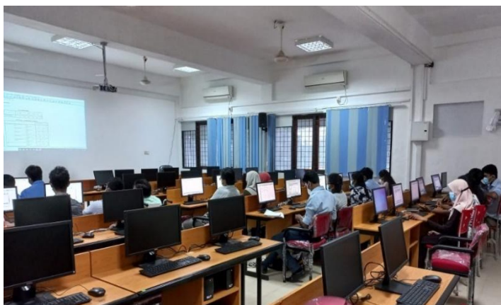
Figure 6: Computer Lab (2021)