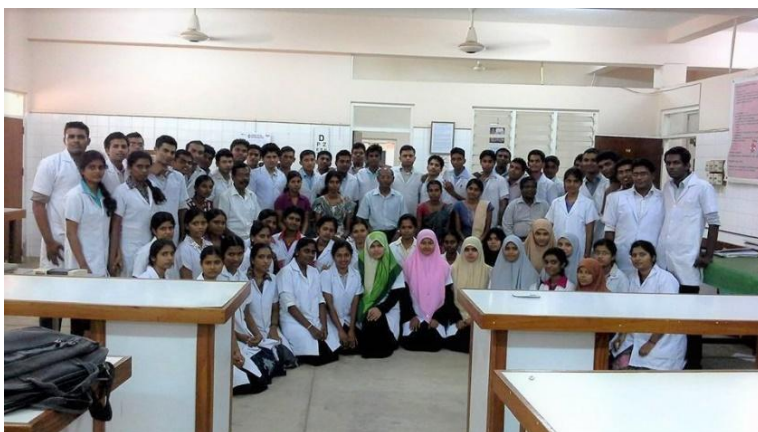
Figure 10: Pre-clinical students after a Physiology practical.

The Evidence-Based Practice and Research Module (EBPRM), which begins in Phase 1 and continues into Phase 3, introduces students to basic research concepts in Phase 1 through lectures, practical activities, and small group discussions. Students must pass the EBPRM assessment in Phase 2 to proceed to the final year.