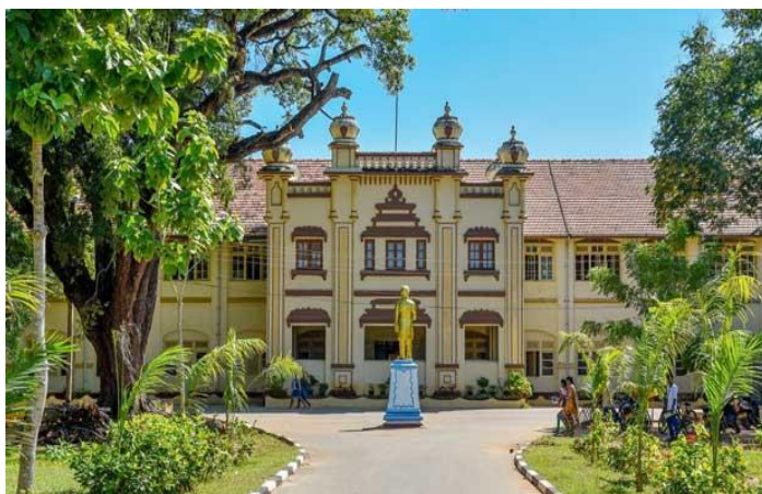
Figure 1: Administrative building of the University of Jaffna.

The University of Jaffna was established in 1974 as a small campus on a 30-acre piece of land belonging to Parameswara College founded by the Philanthropist, Sir Ponnampalam Ramanathan. The University has grown since and is today home to ten faculties, with a student population of over 10000.