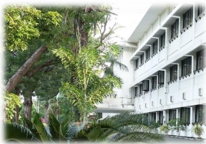
Figure 4: West wing of the Faculty

Telephone: 0212222073, 0212218173, 0212218170